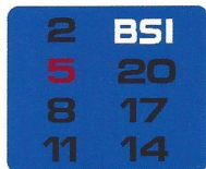
SHOWN ACTUAL SIZE (at refrigerated temperature)

20 is GREEN and sample is ready to be returned to the refrigerator